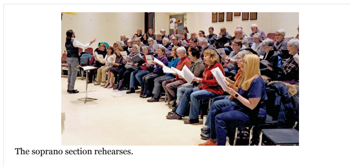
The soprano section rehearses.