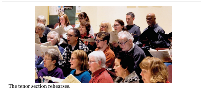
The tenor section rehearses.

This site uses Akismet to reduce spam. Learn how your comment data is processed.